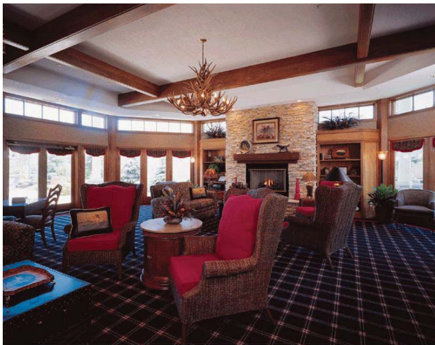
Chat with your friends in the lounge