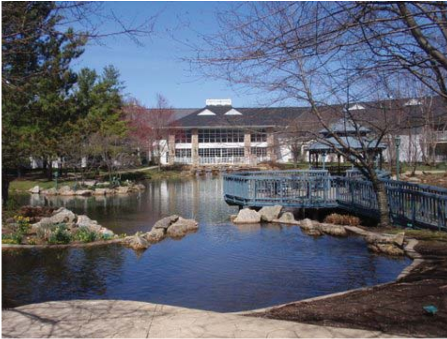
Cherry Valley Lodge

“First in flight and first in light” because of the native sons of Ohio, the Wright Brothers of Dayton, and Thomas Alva Edison inventor of not only the incandescent light and the phonograph but many other devices that we can be thankful for. And when it comes to things out side of this world, Ohio is the birthplace of John Glenn, the first man to orbit the earth and Neal Armstrong who was the first man on the moon.